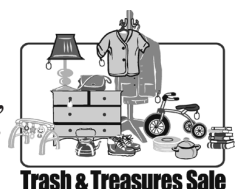
Trash & Treasures Sale

Mark your calendar! This fall the Trash & Treasure Sale will be Friday, September 30, and Saturday, October 1. Preferred Customer Sale for church members will be Thursday, September 29, from 7 to 9 pm. Items for the sale may be brought to Pierson Hall starting Tuesday, September 27, after 2 pm.